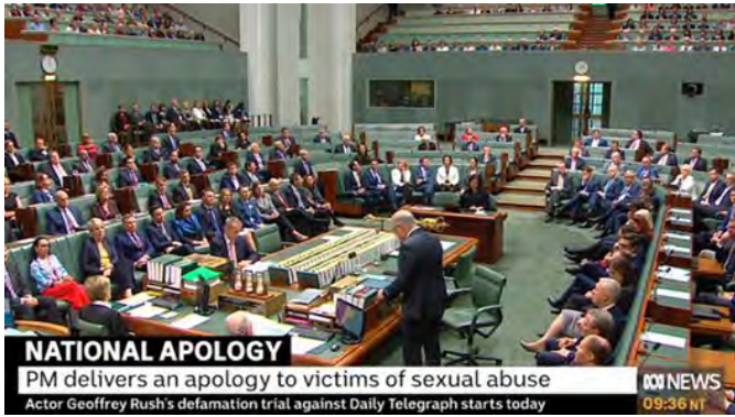
House of Reps of the Prime Minister's National Apology delivered in Parliament on 22 October, 2018.

For the Innocents (FTI) offers this example of a pilgrimage in solidarity with the abused innocent victims. We offer it as a resource, a stimulus for others to create their own pilgrim ceremony.